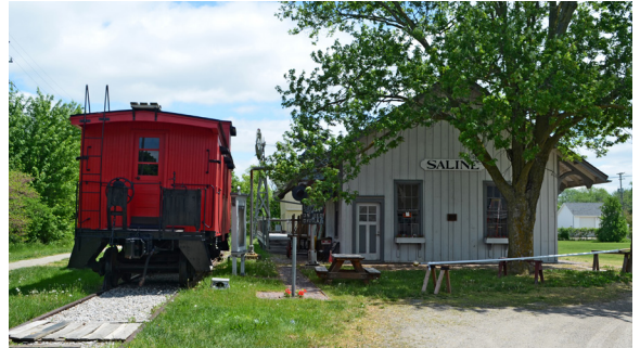
Photo: Saline Depot

Development of both automobiles and the trucking industry reduced travel by train and trolley. Rail passenger service to Saline was discontinued in the late 1930s; freight service hung on until the early 1960s.